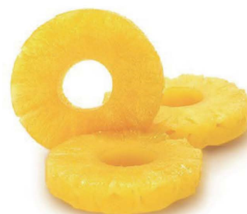
Frozen Pineapple Ring 50c