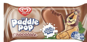
Paddle Pop $2