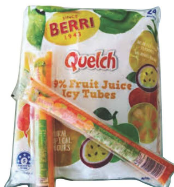
Quelch Icy Tube 50c