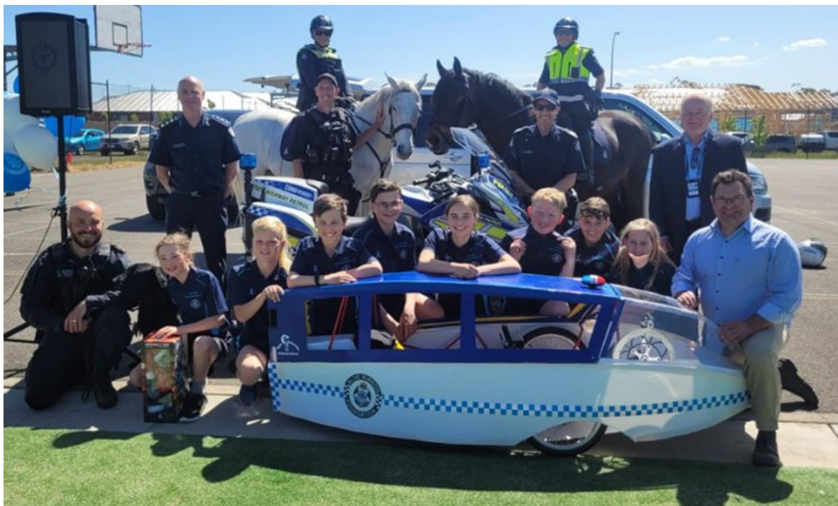
(2023 Blue Ribbon HPV Team)

New Gisborne will participate in the Tryathon event in 2024. Students will maintain and race a recumbent tricycle throughout an obstacle course, sprint race and 8 hour endurance event. Students are also required to present their learning to a panel of judges in a 10 minute presentation.