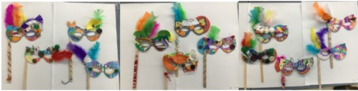
FOUNDATION – COLUMBINA MASKS