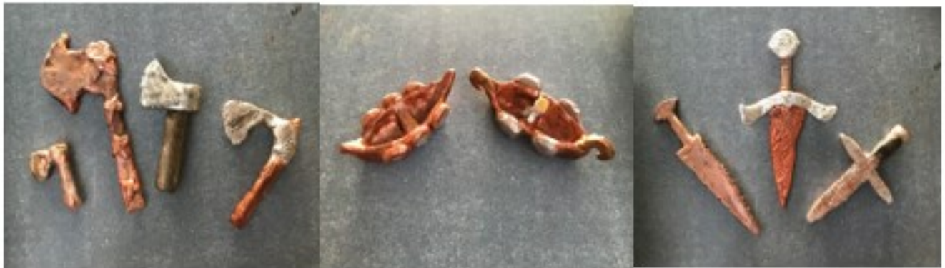
Year 5 Clay Sculpture – Viking Artefacts